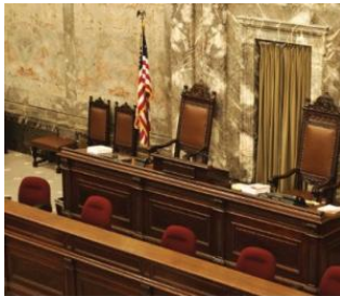
CRS Report for Congress: A Federal Chief Technology Officer in the Obama Administration: Options and Issues for Consideration